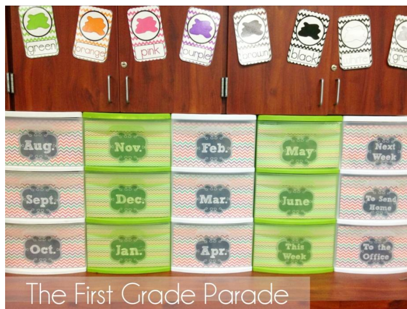
The First Grade Parade

{This is where I store all my station/center activities}